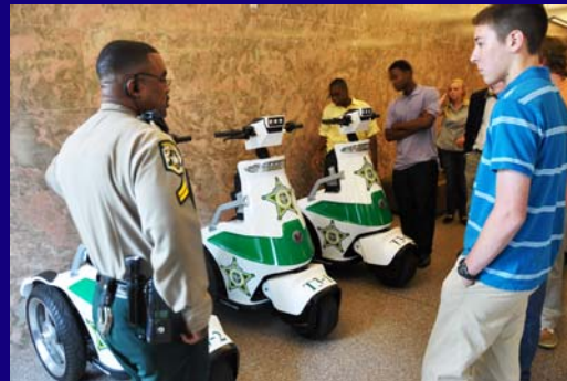
STUDENTS LEARN ABOUT THE ROLE OF THE MECKLENBURG COUNTY SHERIFF’S OFFICE IN THE JUDICIAL SYSTEM

Court Camp is hosted by The Trial Court Administrator’s Office and sponsored in partnership with Justice Initiatives, Inc.