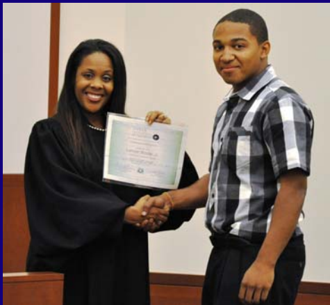
A DISTRICT COURT JUDGE

A Summer Day Camp Designed to Teach Teens About the North Carolina Judicial System