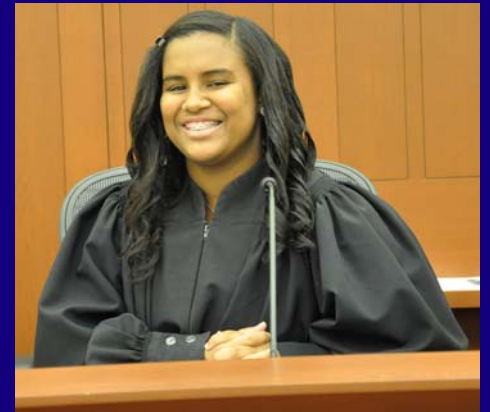
STUDENTS ROLE PLAY DURING A MOCK TRIAL IN AN ACTUAL COURTROOM