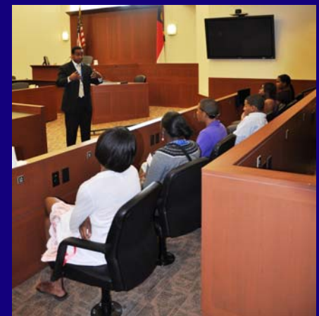
STUDENTS MEET ASSISTANT DISTRICT ATTORNEYS AND OTHER COURT PERSONNEL